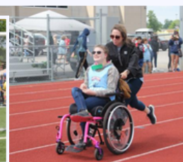
Photos above taken at the 2023 DSBN Special Olympics.